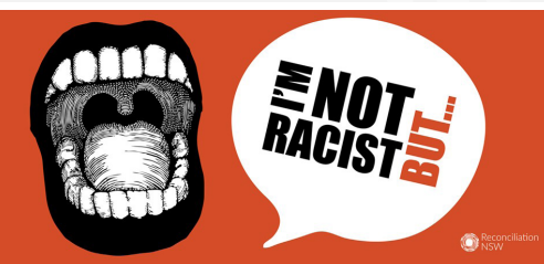
Our popular and thought provoking Anti-Racism event, Im Not Racist , But... part of Vivid Sydney 2022

Our Anti Racism program works to progress a national understanding of racism's diverse impacts on individuals and systemic justice. We provide anti-racism education through a range of platforms - including in schools, social media, toolkits for individuals and workplaces, webinars and public forums and events.