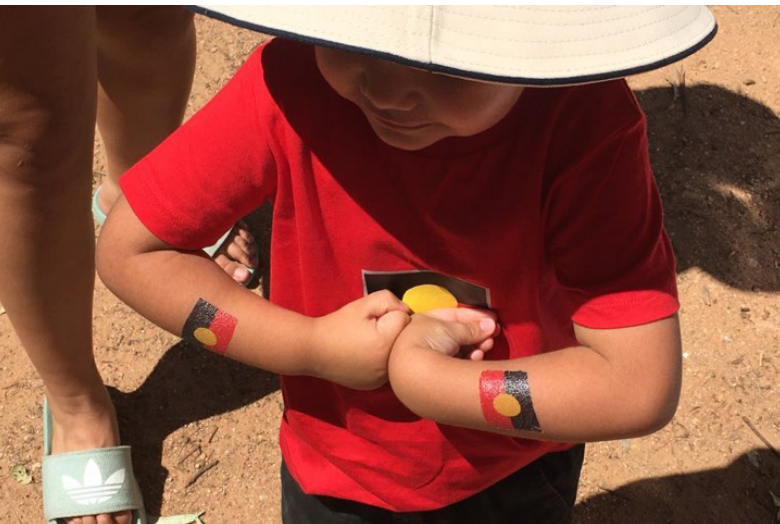
Young supporter at Yabun 2022