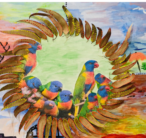
SRC artwork entry 'One sky forever and always' by Kings Langley PS 2021

The SRC is our premier schools program, now in its 13th year. This art and writing competition allows students to learn about and celebrate Aboriginal and Torres Strait Islander culture. Inspired by an annual theme, students reflect on what reconciliation means to them and create artworks and stories. The finalist exhibition tours throughout Sydney and regional NSW to promote reconciliation throughout the state. With more than 19,000 entries to date, in 2021 we reached over 15,000 students via webinar participation and our SRC website.