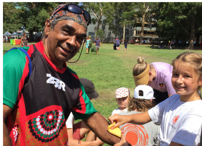
Everyone loves getting Aboriginal and/or Torres Strait Islander flag tattoos!