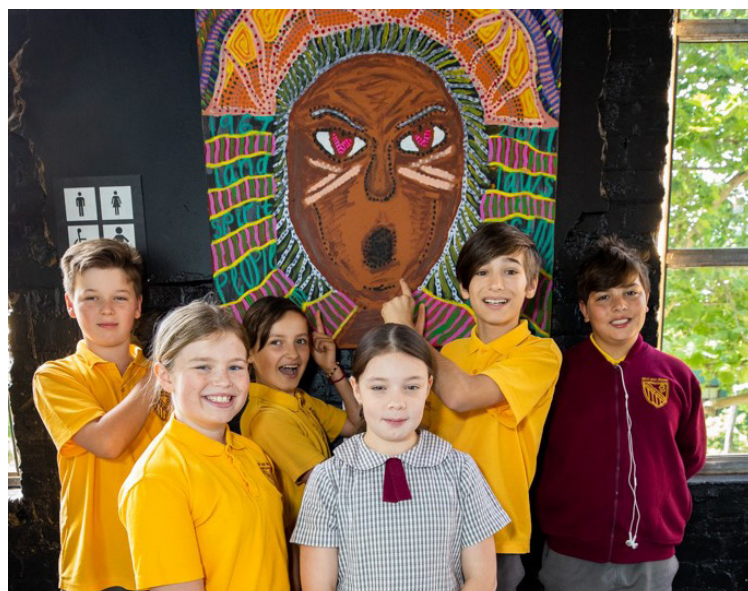
SRC artwork entry 'Our place, our destiny' by Orange Grove PS 2019