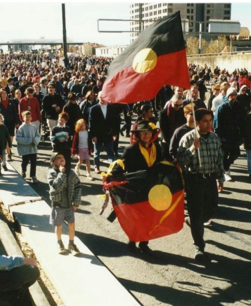
Where it all began: the 2000 Sydney Harbour Bridge Walk for Reconciliation

Our Truth Telling program amplifies First Nations voices to educate Australians on the true histories of this country. Through workshops, events, online webinars, tools and social media campaigns, we provide information and resources for individuals, schools and organisations to understand the unique position of Aboriginal and Torres Strait Islander Peoples in this country. This work includes: