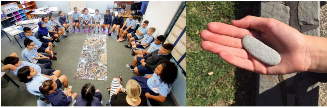
Lansvale East PS holds a yarning circle each morning