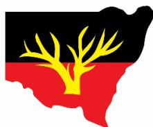
New South Wales Aboriginal Land Council